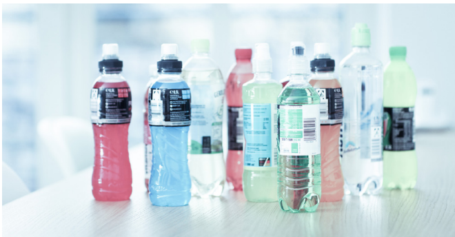
Fig.1 Isotonic beverages

of 150 \mu L. The diagram in Fig 2 shows the average values of osmolality for the isotonic samples together with the EFSA limits. The non-isotonic beverages have a much higher osmolality. For samples of caffeine containing soft drink and beer osmolalities of 644 mOsmol/kg and 1008 mOsmol/kg, respectively, were determined. As alcohol is also depressing the freezing point, the osmolality